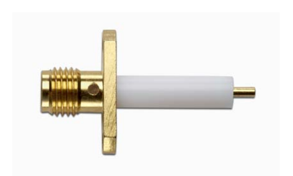
Model 72961 SMA JACK PANEL RECEPTACLE (2 HOLE)